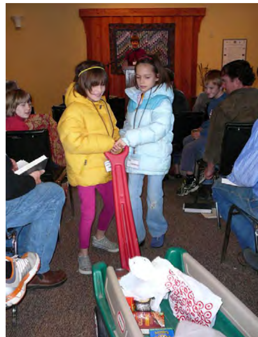
Kids touring the sanctuary with the ‘green wagon’ collecting donations for the Food Bank and the Samaritan House